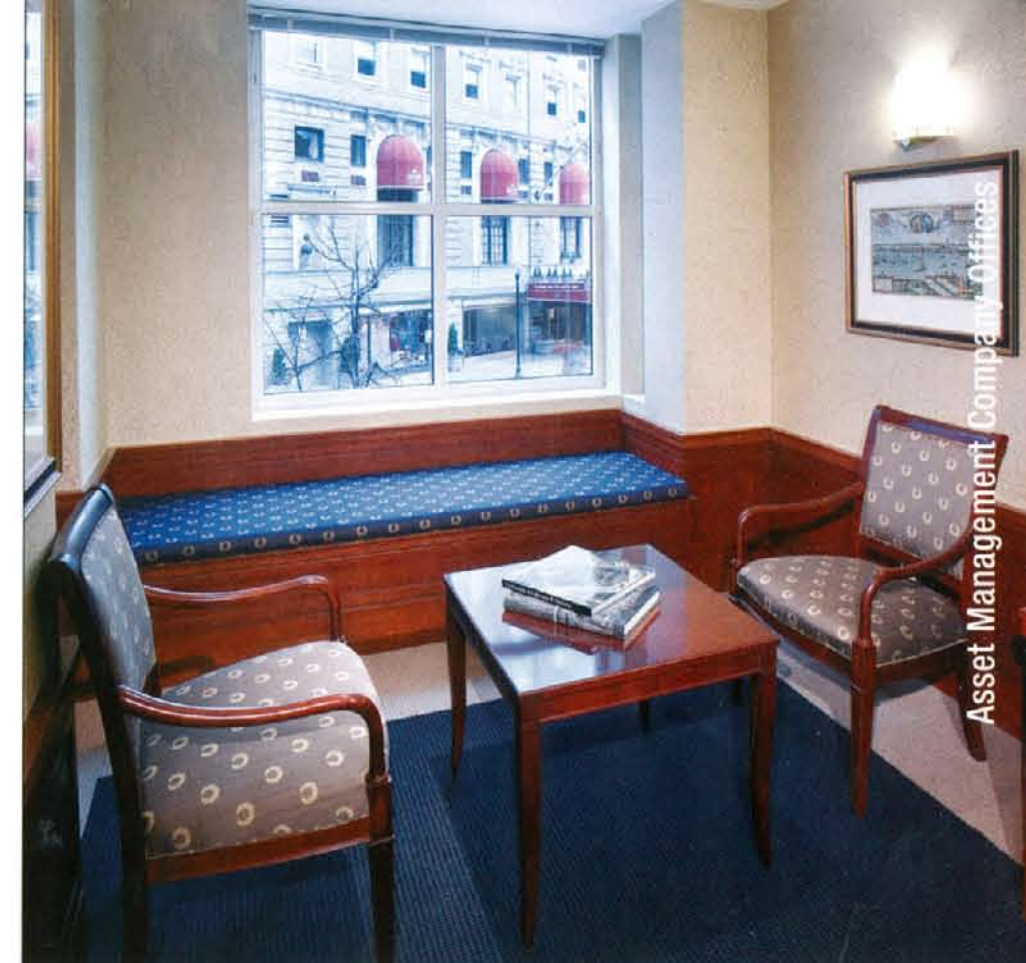
Asset Management Company Offices

Because the project was on a fast-track schedule, completed in seven