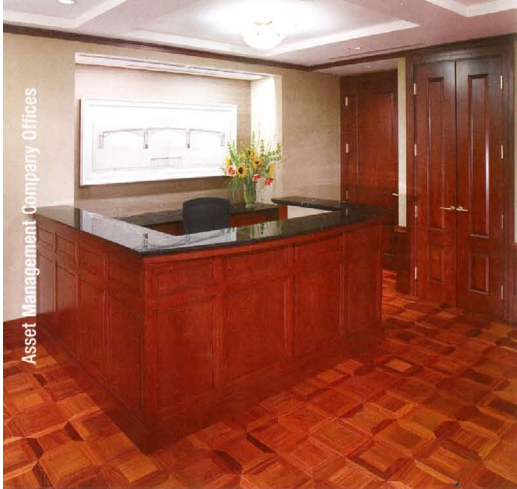
Asset Management Company Offices