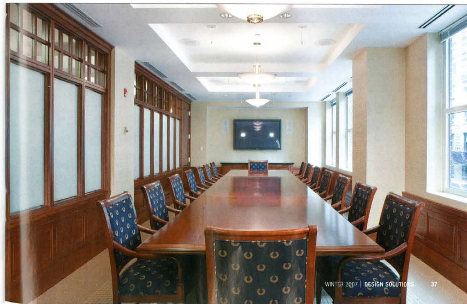
▲ COMFORTABLE AREAS FOR RELAXATION and informal collaboration are provided for the staff. ▼ THE CONFERENCE CENTER is accented with elegant Cherry wainscot and window walls.