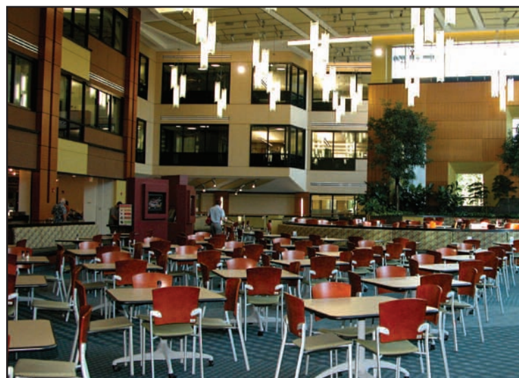
NATURAL LIGHT: The Blue Cross multi-purpose room is bathed in pure light.